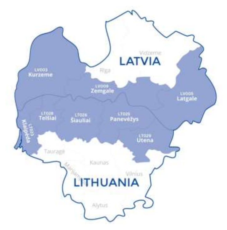
Figure No. 1. Programme area